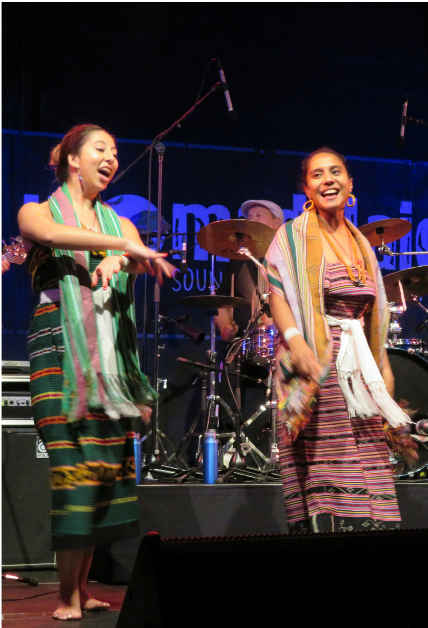
Timor-Oans Cultural Group and the Dili Allstars, Womadelaide 2023.